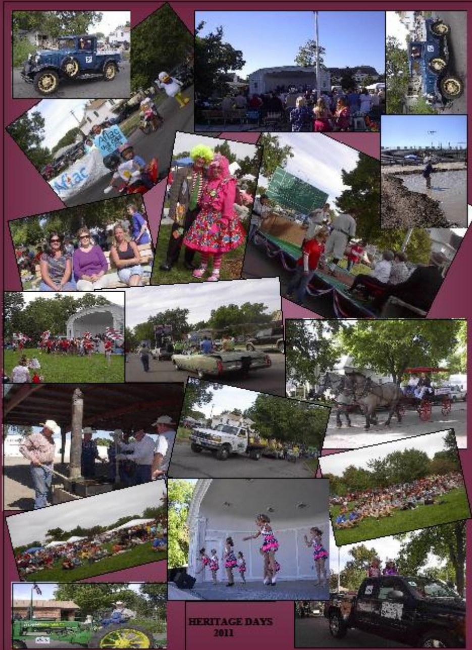
HERITAGE DAYS 2011