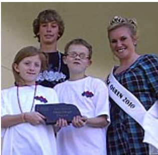
The Shoe Shine Group