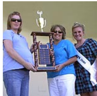
Lifetime Eye Care