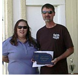
McCook Christian Church