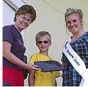
Hillcrest Nursing Home